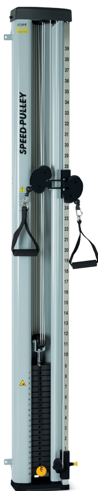
Speed pulley 50kg